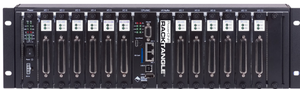
UEIPAC 1200R RACKtangle 12 Slot Programmable Automation Controller